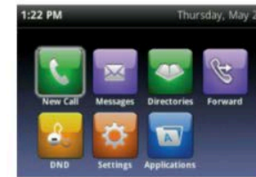
HOME VIEW: Access call history, directories, features and settings.