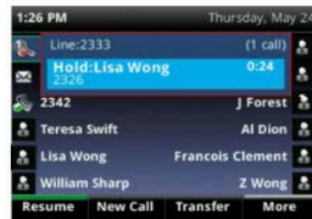
LINES VIEW: Default Display showing your lines and favorites.

Below are some of the common views you'll use on your display screen.